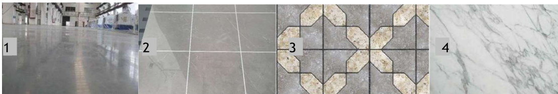
1. C oncrete Floors 2. T ile Floors