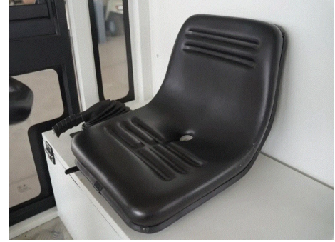
Safe and Suitable Seat