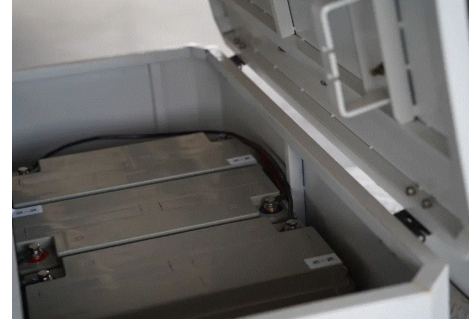
Long Endurance Battery