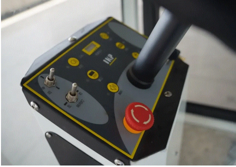
Simple Operation Panel